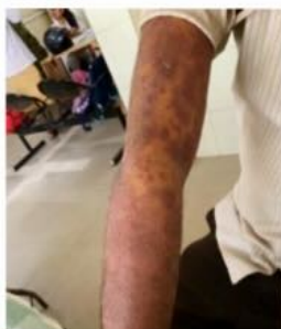
Figure. 1 (04/02/2024)