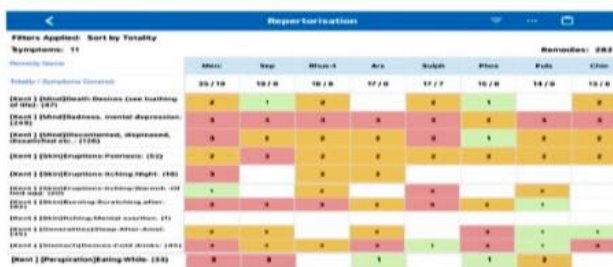
Figure-1 Repertorisation chart

Software Used: Repertorisation was done with the help of Hompath software.